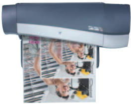
HP Designjet 130 printer series

The most affordable multi-format D/A1-size graphics printers that deliver fade-resistant* photo-quality with consistent color via HP Professional Color technologies.